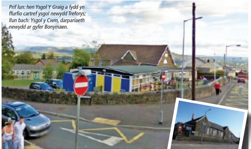
Prif lun: hen Ysgol Y Graig a fydd yn ffurfio cartref ysgol newydd Treforys; llun bach: Ysgol y Cwm, darpariaeth newydd ar gyfer Bonymaen.

môr. Daeth Ysgol y Cwm yn rhydd trwy ad-drefnu addysg Saesneg yr ardal.