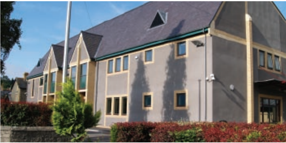
Uned Gymraeg Ysgol Uwchradd Llanfair-ym-Muallt, darpariaeth uwchradd cyfrwng Gymraeg bresennol de'r sir.