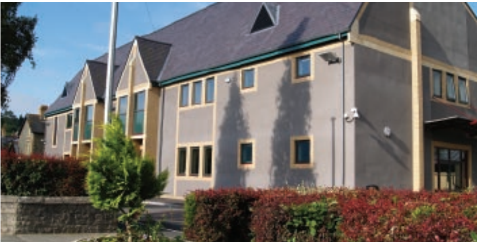
The Welsh medium unit at Builth Wells, the current Welsh medium secondary provision in the south of Powys.