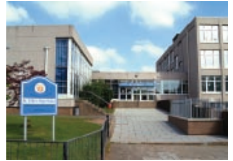
The site of Cardiff's proposed third Welsh medium secondary, the former St Teilo's RC school.

Turning to the secondary sector, the catchment areas of all three (Glantaf, Plasmawr and the future third school) have been finalised and the authority has now started appointing members of the new shadow governing body which will be in place until the school opens in Sept 2012. The shadow